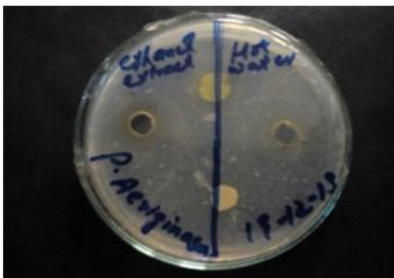
Fig. 4. Activity of Hot water and Ethanol extract of Cannabis Sativa leaf against P.aeruginosa strain.