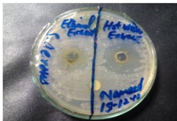
Fig. 2. Activity of Hot water and Ethanol extract of Cannabis Sativa leaf against S.aerious strain.

The extracts of the investigated plant species showed antimicrobial activities against all tested bacterial strains. Results of the antimicrobial activity obtained using the well diffusion assay is summarized in Table.