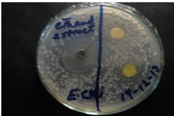
Fig. 3. Activity of Hot water and Ethanol extract of Cannabis Sativa leaf against E.coli strain.

a great advancement in microbial infection therapies. Therefore, there is needed to develop new antibacterial agents which can satisfy the present demand.